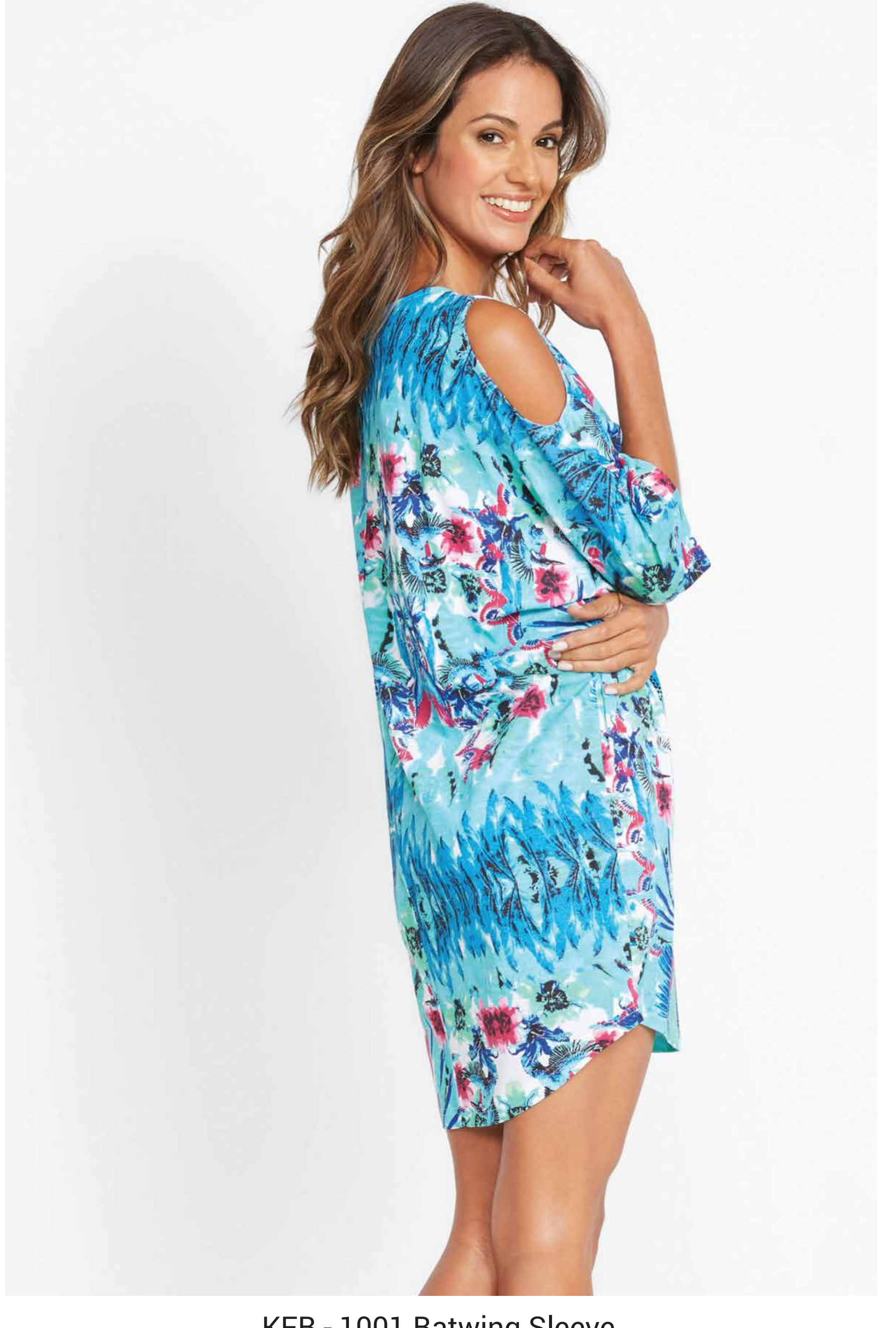
KFB - 1001 Batwing Sleeve, Cut out, AOP, Studs.