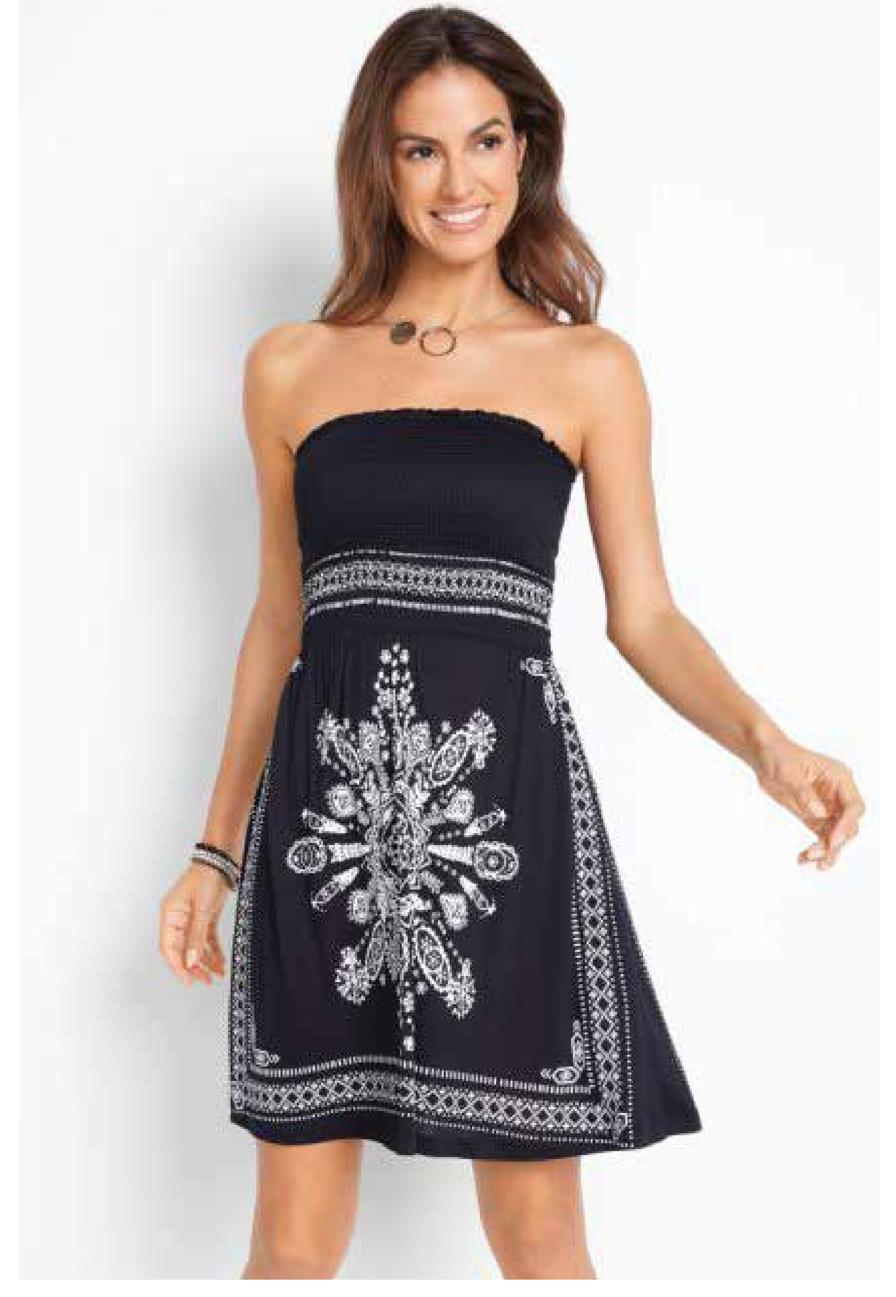
KFB - 1006 Tunic Shirt, Placement Print