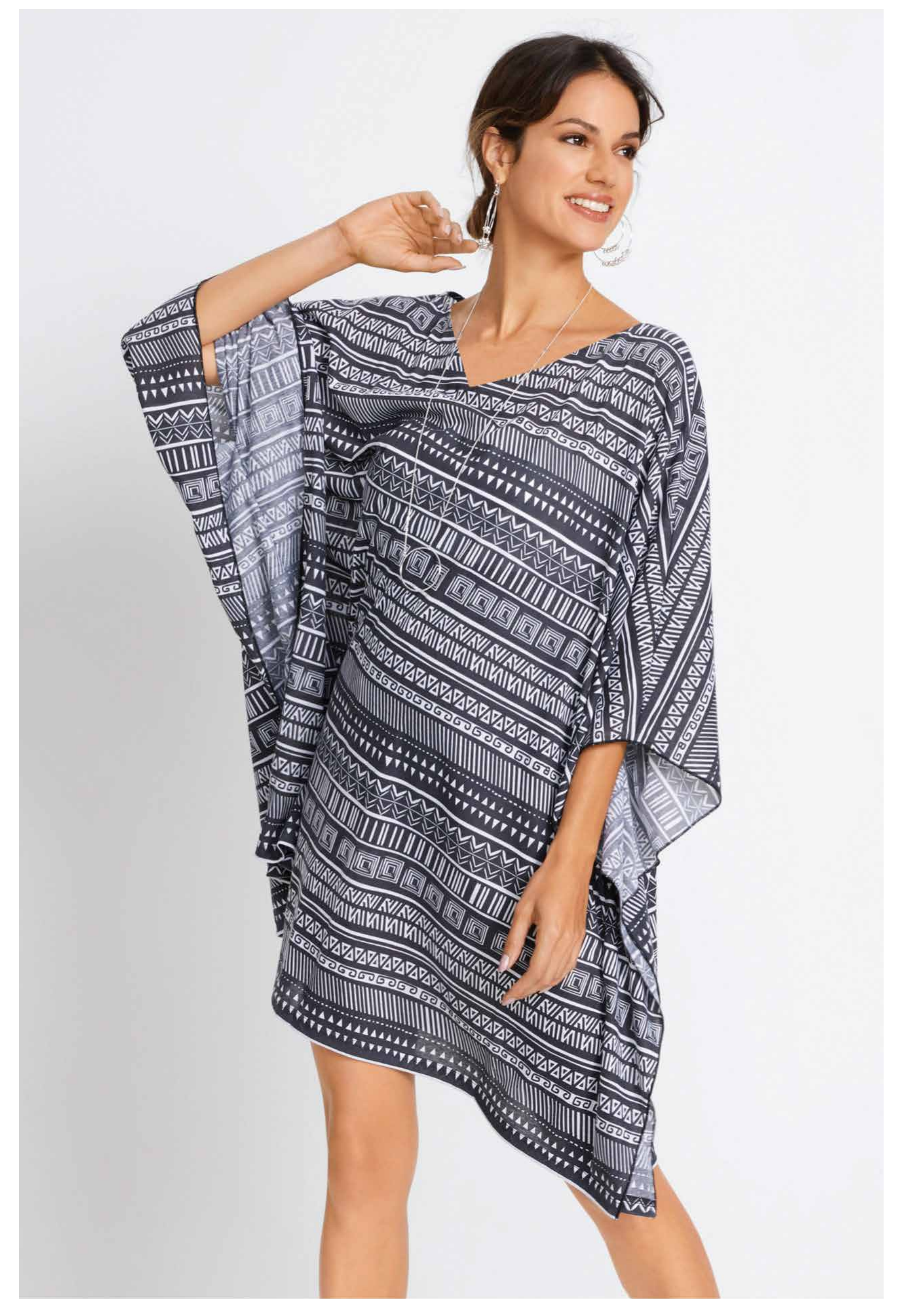
KFB - 1005 Tunic Shirt, AOP