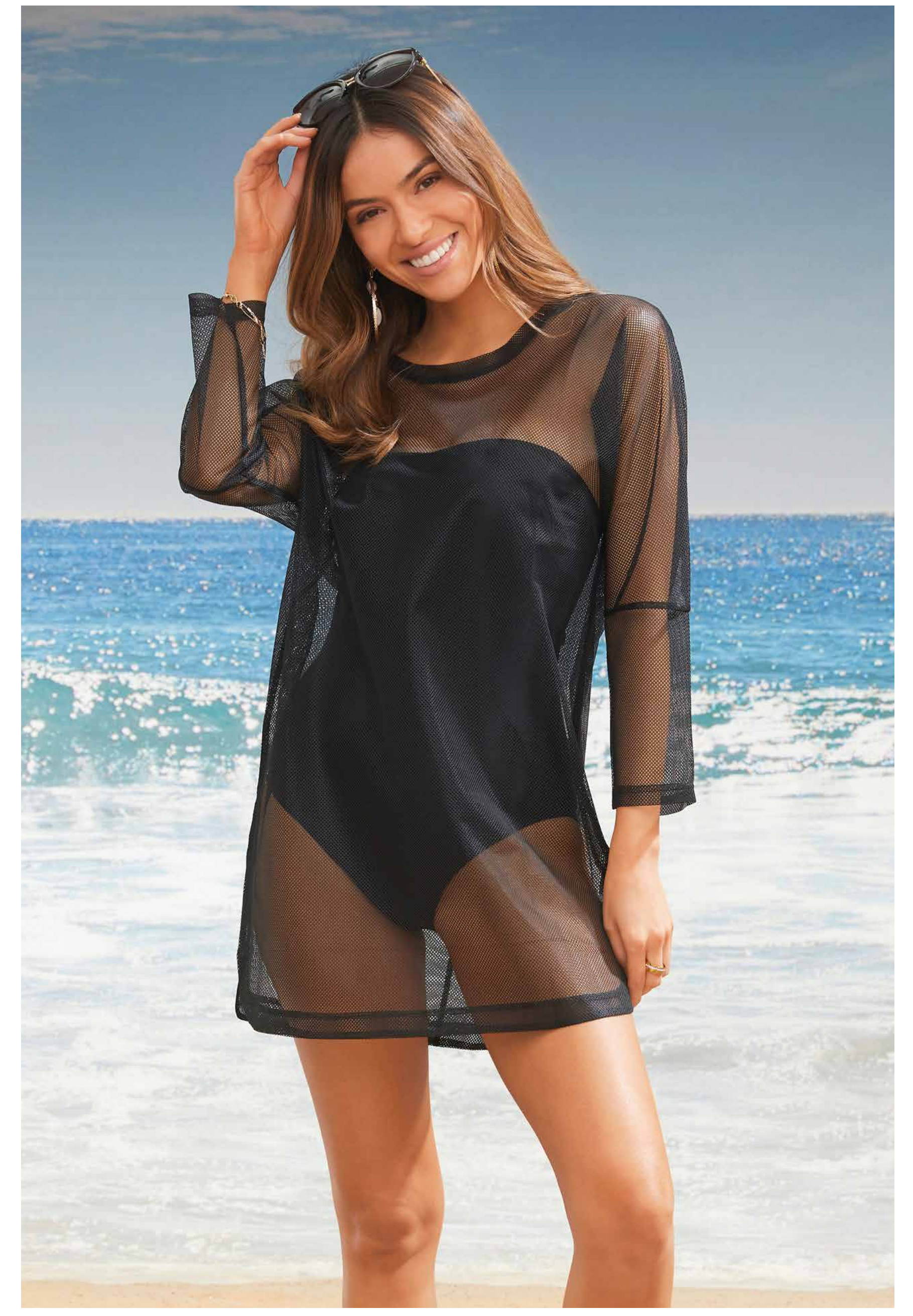
KFB - 1014 Mesh Knit Fabric