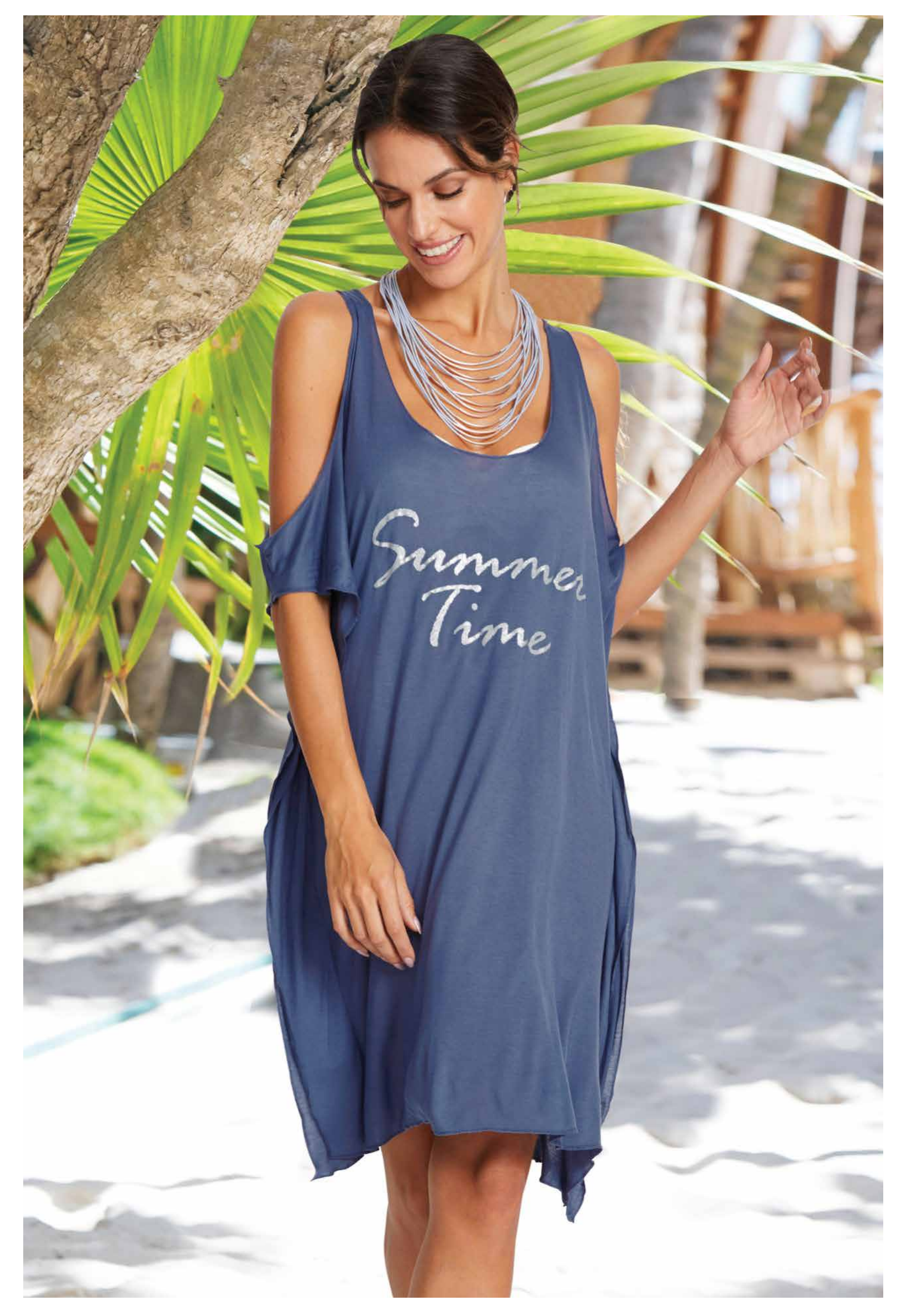
KFB - 1002 Cut outs, Glitter Print