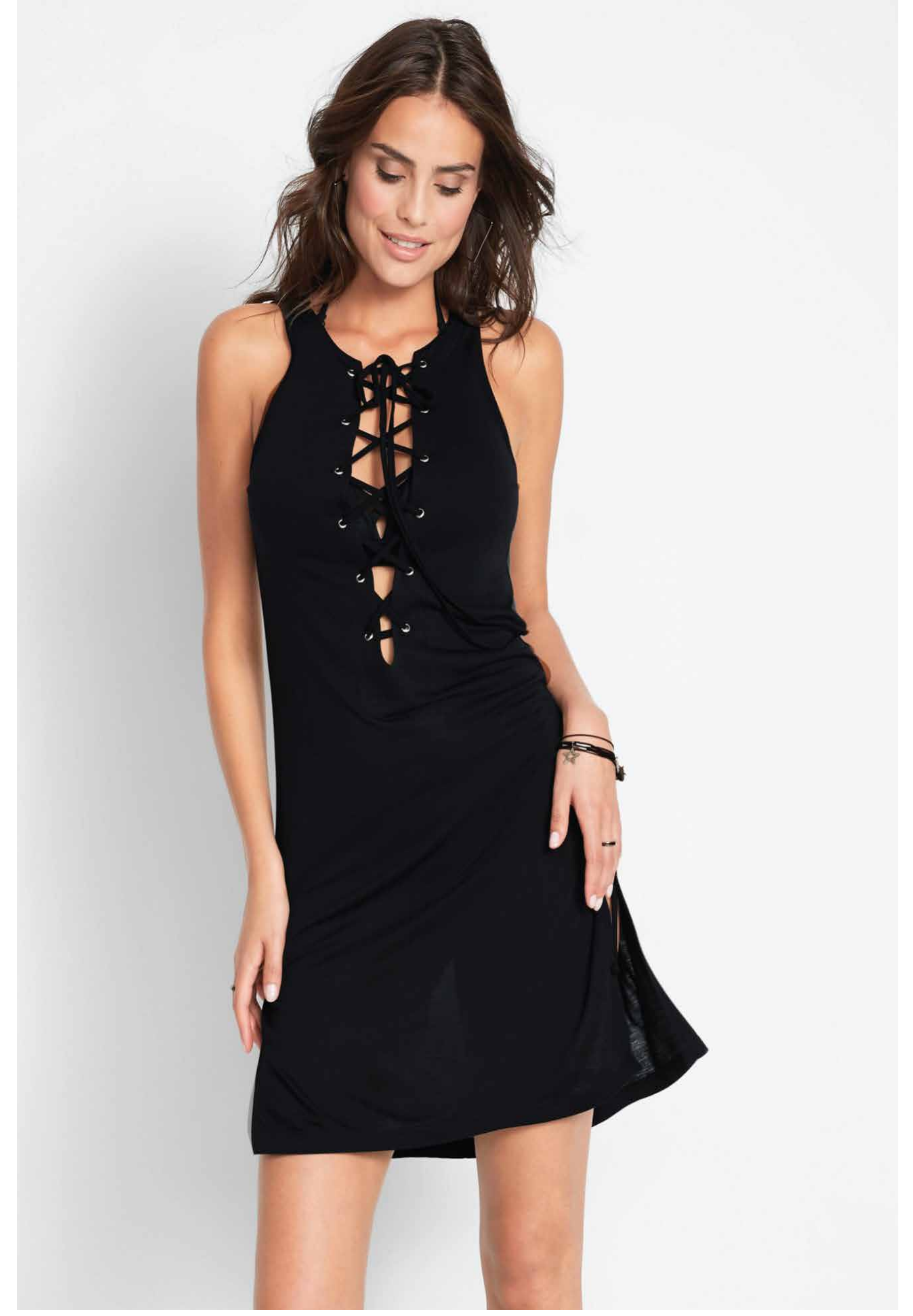
KFB - 1003 Short Dress