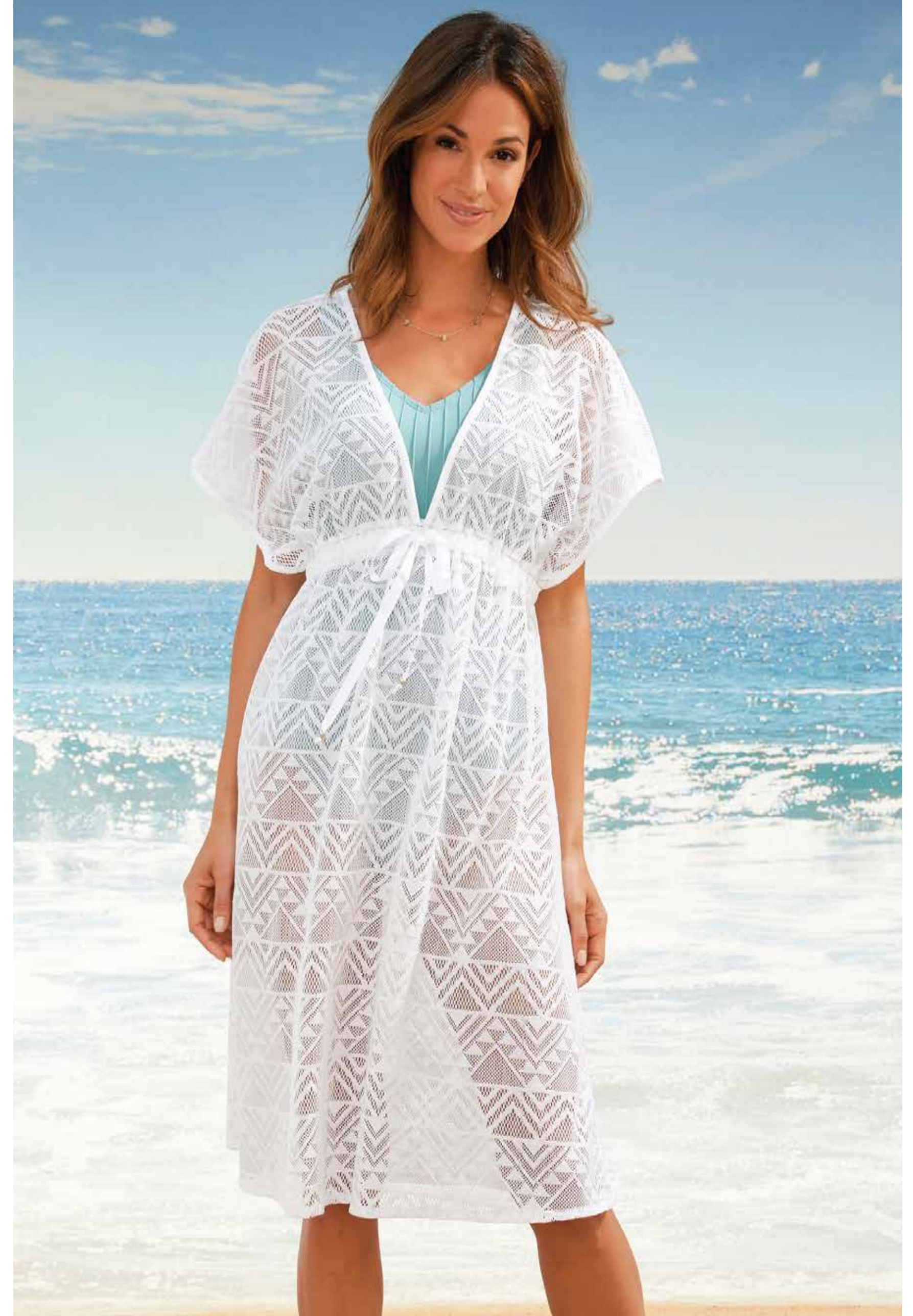
KFB - 1009 Lace Dress