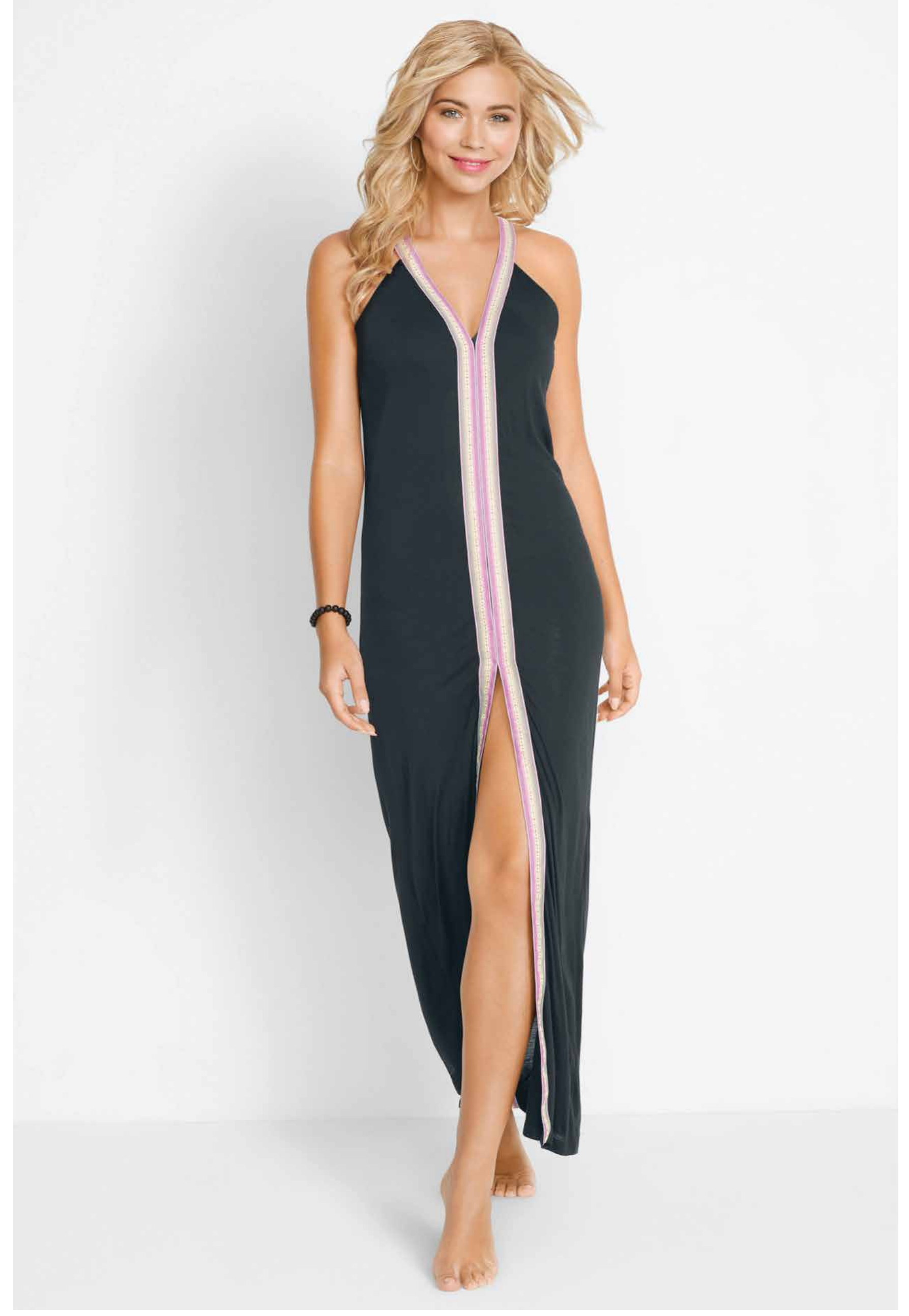
KFB - 1004 Sleeveless, Fancy Tape