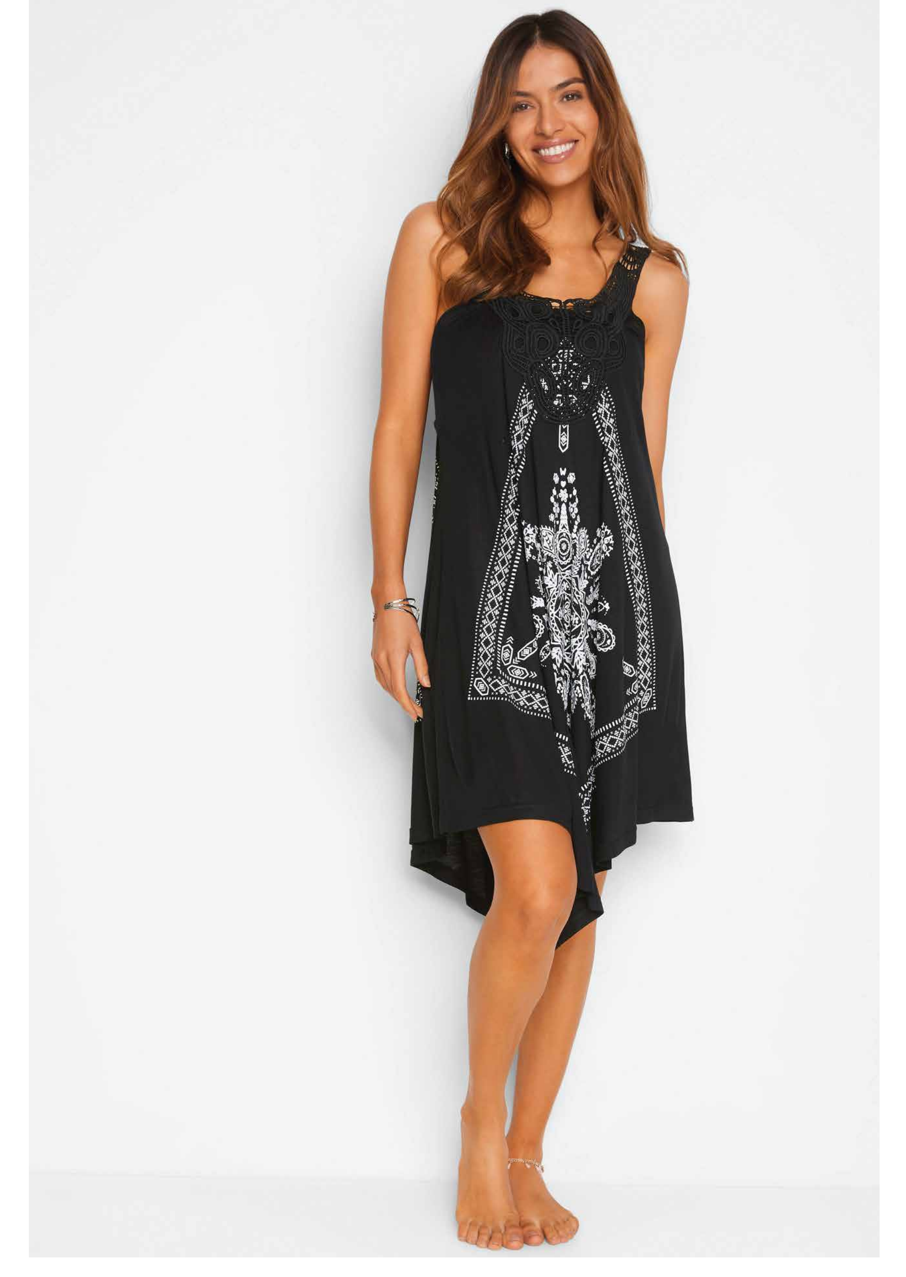
KFB - 1012 Square Skirt, Crochet Lace