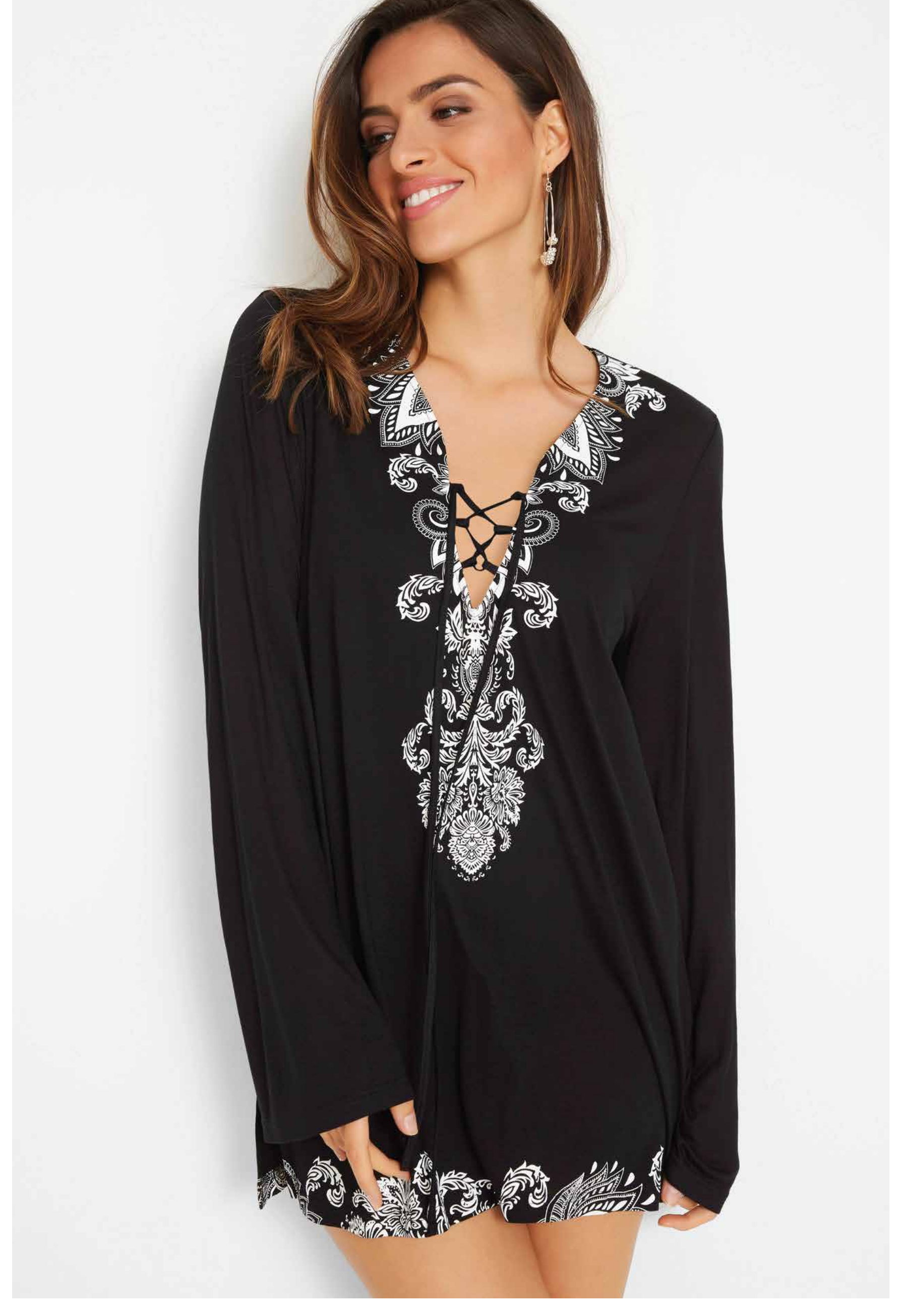
KFB - 1007 Bandeau Dress, Smcoke, Placement Print