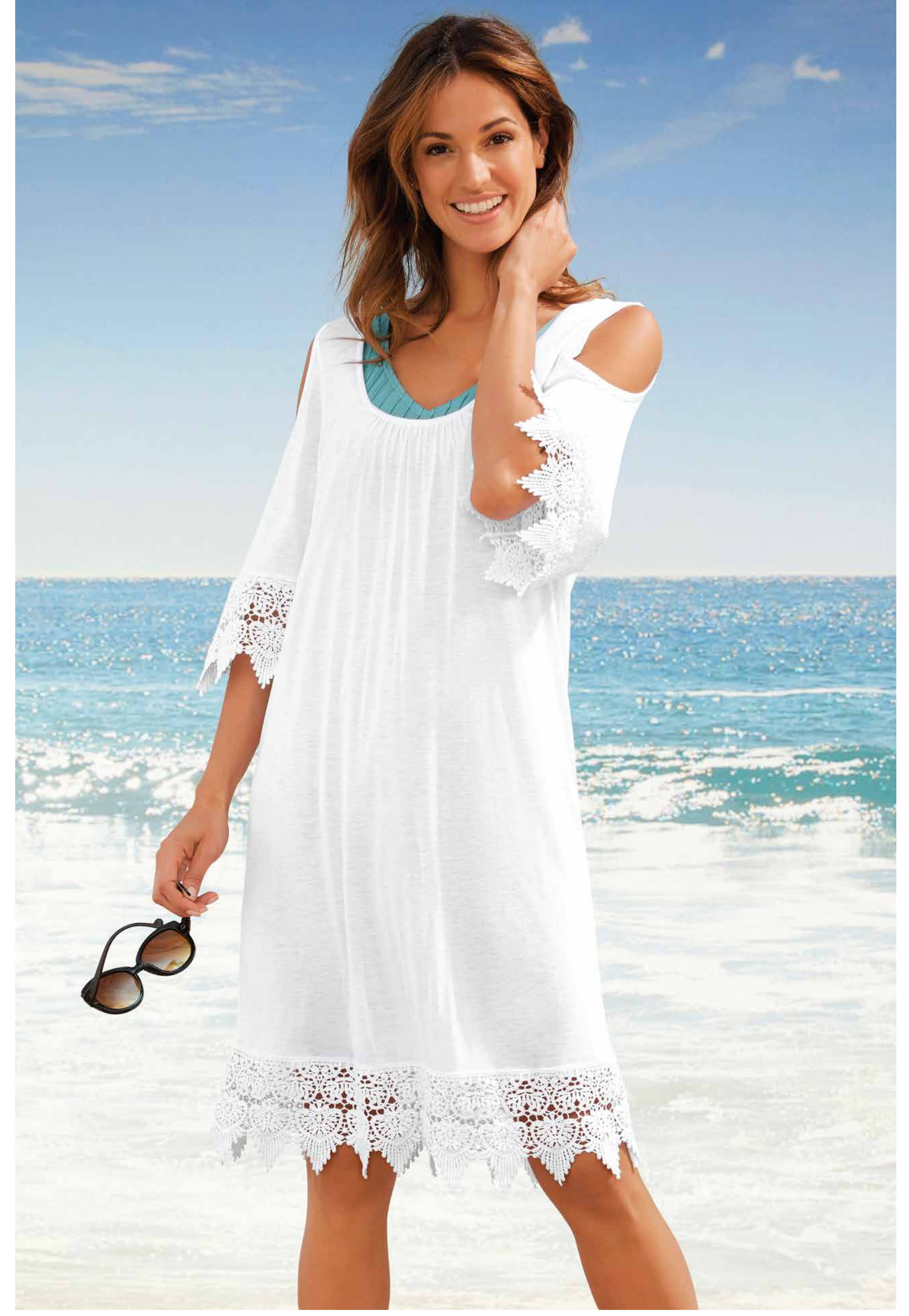
KFB-1010 Cut At Shoulder, Crochet Lace At Hem